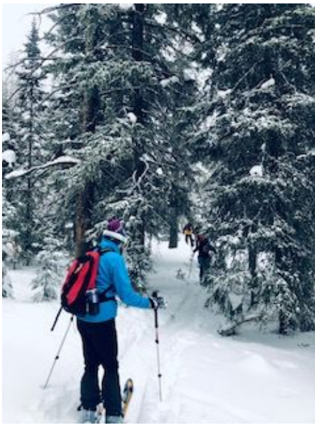
Snowshoeing group and/or Yak Traks