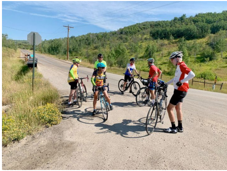
Road Biking Hilton Gulch Schoolhouse