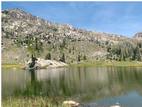
Mica Lake Hike