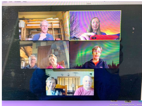
ZOOM HAPPY HOUR