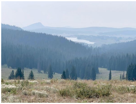
Dumont Lake Loop Hike