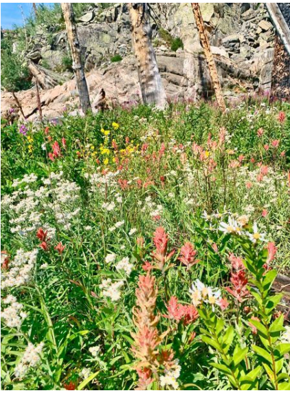
Mica Lake Wildflowers