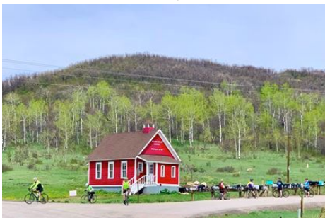
Road Biking Group

be an out and back route along Trout Creek on June 5. We will meet every Friday, 9:00 a.m., at River Creek Park, Mount Werner Road and Lincoln Avenue, and drive to the start of each ride. A mountain bike or a gravel bike will be appropriate for any of these routes and e-bikes are welcome. We will attempt to have ride options that are appropriate for slow riders, faster riders and e-bike riders. No one will be left behind.