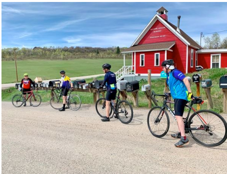
Road Biking Group