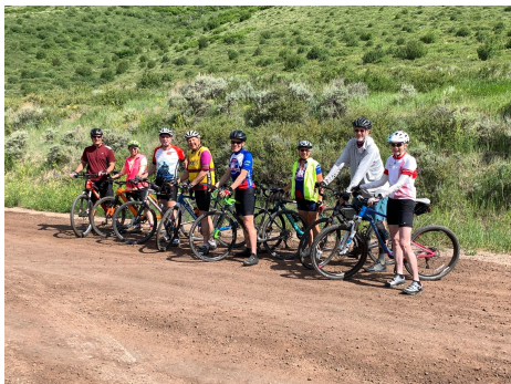
GRAVEL ROAD BIKE RIDING