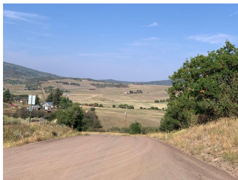
Gravel road Biking